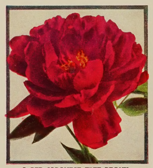
A RED JAPANESE TREE PEONY

The varieties illustrated here in color produce flowers averaging 5 to 8 inches in diameter.